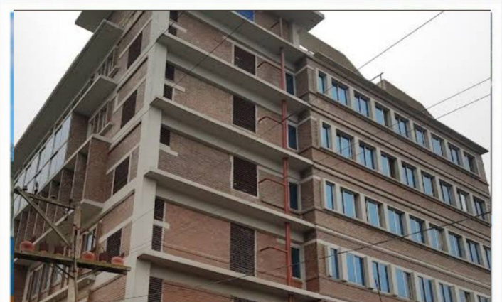
Sabah Designers Ltd