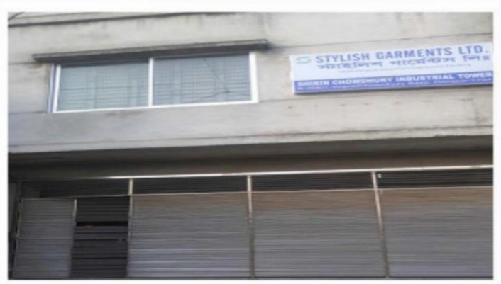
Stylish Garments Ltd